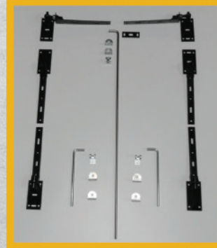
Barn Door Hardware