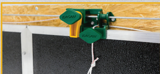
Can be ordered with or without a winter latching system