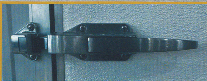
Easy to Close Heavy Duty Latch