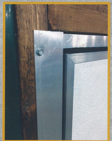
Flush Mount Installation